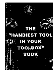
Aviation Mechanic Handbook Handy toolbox size reference for mechanics, aircraft owners and pilots Softcover $16.95